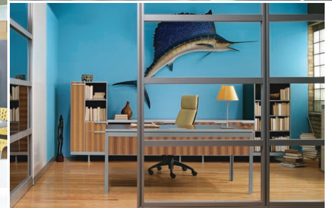
2 Audrey table, storage, and Hollie chair