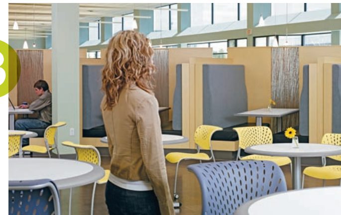
3 Hannah chair and Rylee table